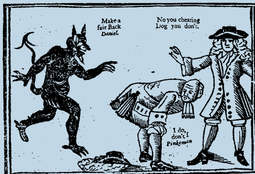
Daniel Defoe and the Devil at Leapfrog (1706)